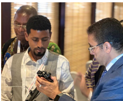
August 2023 Attended international conference in Ghana