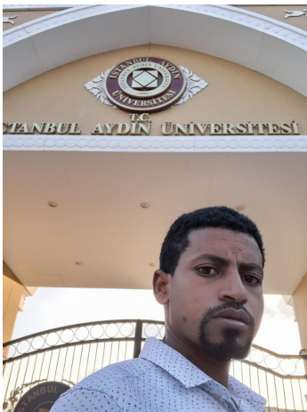
August 2023 Attended Endoscopy service in Turkey