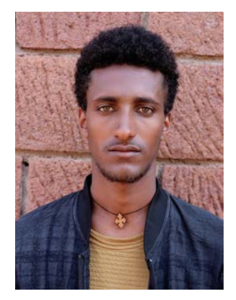
Alkan College, Bahir Dar 2nd. Year Nursing