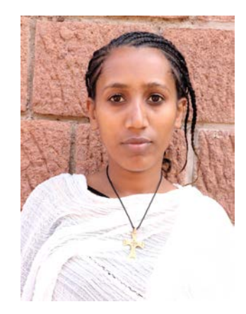
Dessie College of Tropical Medicine and Science 5th. Year Pharmacy